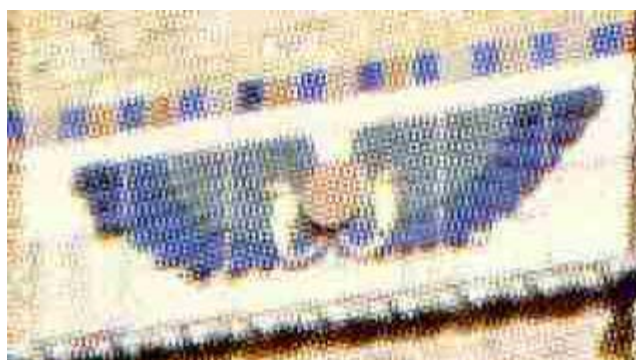
Winged sun god Ra on outside of Queens, New York Assembly Hall