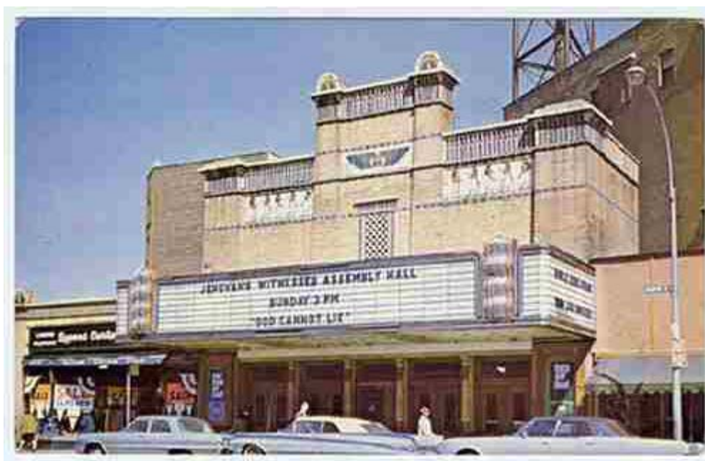
Full view of Watchtower assembly hall used for years in New York, still in use.

Russell owned a cemetery in Pittsburgh. Leading Satanists try to own cemeteries for several reasons. First, it facilitates the disposal of human sacrifices, which are buried in pieces below the fresh holes dug for someone else's burial. When the casket is placed in the hole, it would be rare for anyone to dig below the casket level ever again. Second, magic power is associated with cemeteries. The spiritual power of the dead is pulled up by making a circle of light over them, and then within the circle a naked Satanist lays. Third, specific bones are sought such as the skulls and left hands. Left hands are preserved in order to hold candles for certain ceremonies. Confirmed Mason. The Russell Bloodline